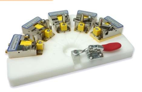
Figure 1: LT-100R-20GD-5P 5pair Raw Cable Test Fixture

Most interfaces, like SATA, SAS, LAN, Infiniband, DVI, HDMI, SFP ...etc, are designed with differential 100 ohms system. The bandwidth of these are wide up to 20GHz or higher. In this, a good test fixture (Jig) for testing the raw cable with multi-AWGs would be very important.